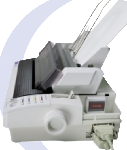
Showing optional sheet feeder, 128Kb memory card and serial interface installed together